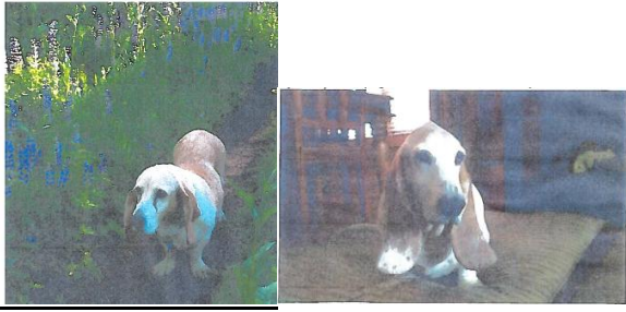
Penney and Bentley, our Basset angels, we will miss you...